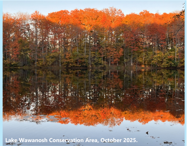
Lake Wawanosh Conservation Area, October 2025.

prepare for future naturalization of marginal farmland areas.