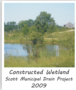
Constructed Wetland Scott Municipal Drain Project 2009