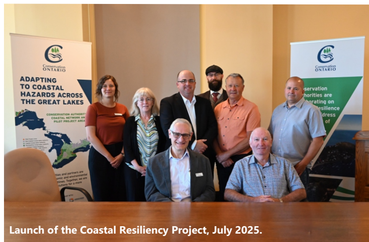
Launch of the Coastal Resiliency Project, July 2025.