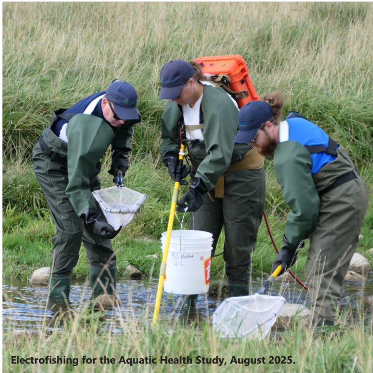
Electrofishing for the Aquatic Health Study, August 2025.