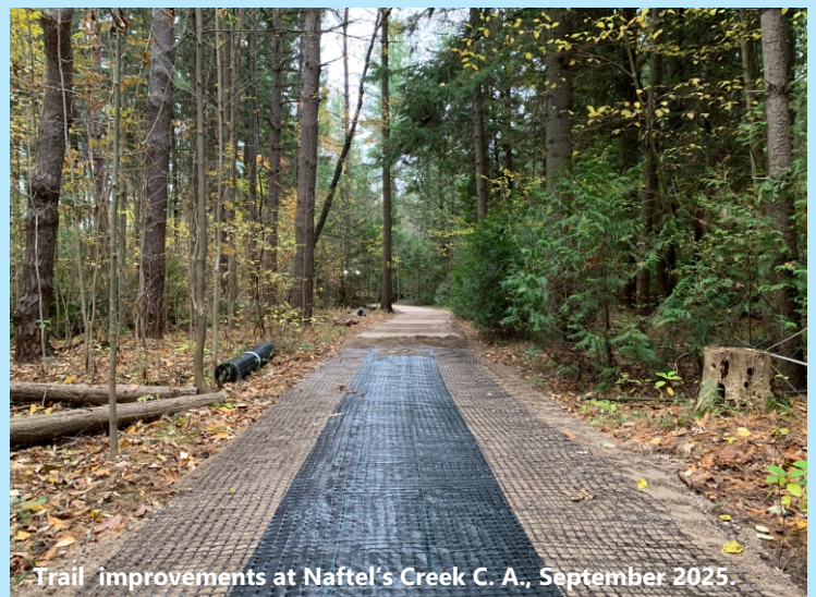
Trail improvements at Naftel's Creek C. A., September 2025.