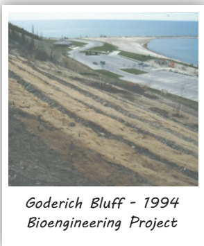
Goderich Bluff - 1994 Bioengineering Project