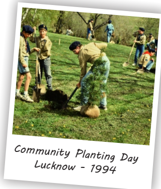
Community Planting Day Lucknow - 1994