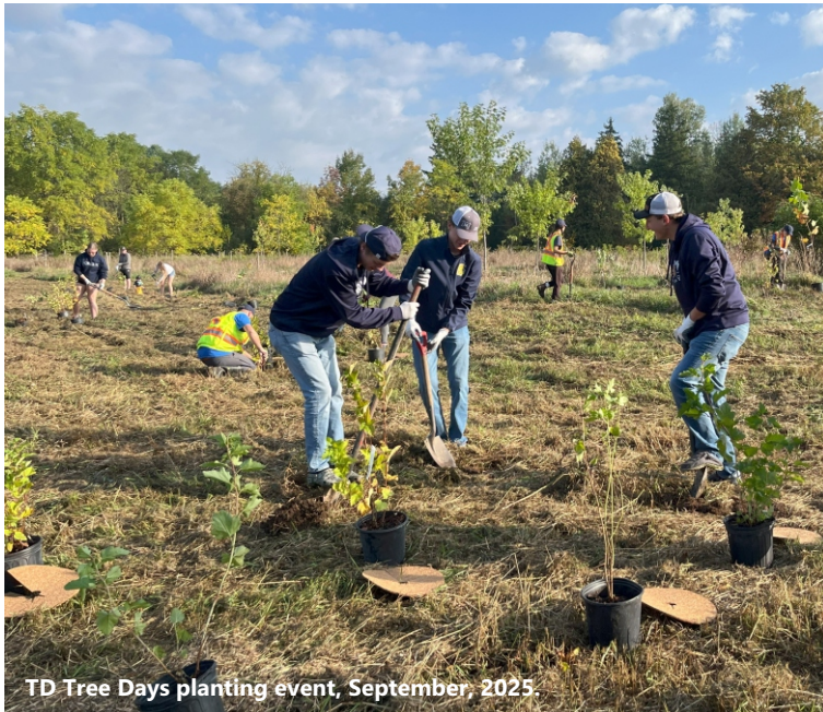
TD Tree Days planting event, September, 2025.