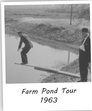
Farm Pond Tour 1963