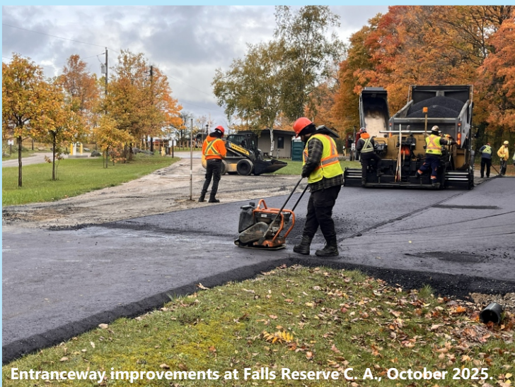
Entranceway improvements at Falls Reserve C. A., October 2025.