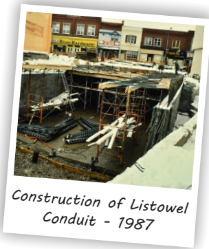
Construction of Listowel Conduit - 1987

1951 - 2026 75 years of watershed conservation. We're celebrating the future of conservation!